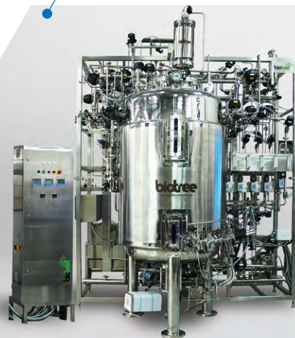
Biotree Stainless Steel Bioreactor