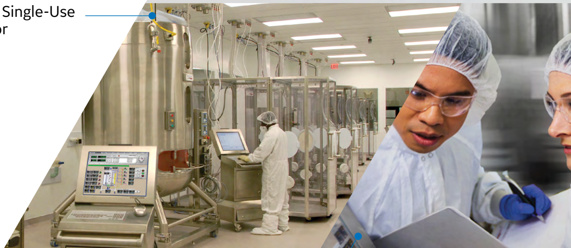
GE Fast Trak Cell1 Training Course