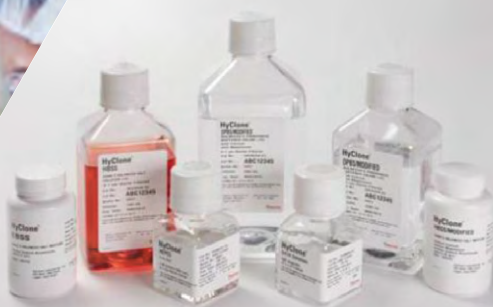
Cell Culture Media & Buffer and processing liquid